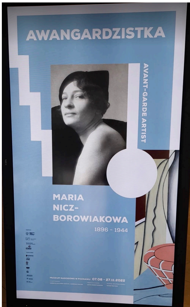
image: Plakat Exhibition @ Museum Narodowe w Poznaniu- Posen Poland. August 13, 2022