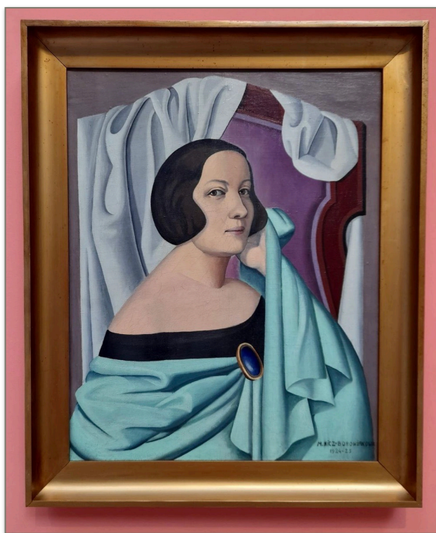
image: Self Portrait 1924-1925 oil on canvas 69,5x 55,5 cm, Family collection warszawa. at the Exhibition @ Museum Narodowe w Poznaniu- Posen Poland. August 13, 2022 imagofeminae XXXIII.

Exhibition @ Museum Narodowe w Poznaniu- Posen Poland. 07.08 - 27.11.2022