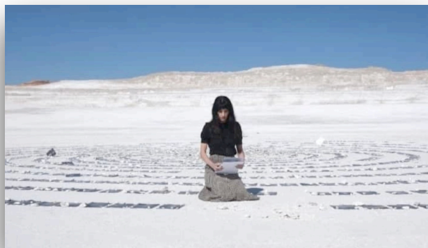
Image: Still from the film LAND OF DREAMS Copyright betafilm.com betacinema.com. imagofeminae CINEMA autumn/ winter 2022 # XXXIV

source: BETA CINEMA PRESS betafilm.com betacinema.com