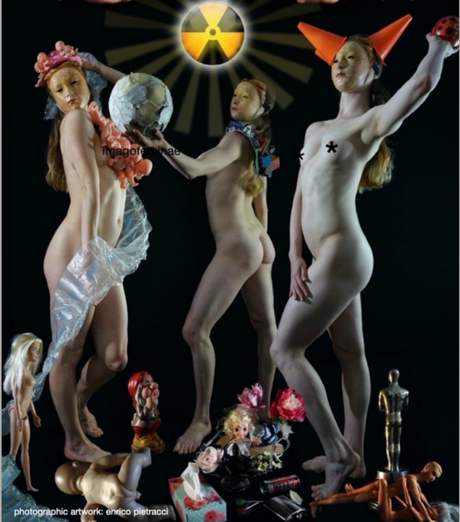
photographic artwork: enrico pietracci

ISSN 2195-2000 Deutsche Nationalbibliothek autumn- winter 2022 # XXXIV Online Digital Print Video Podcast TV international women's quarterly magazine