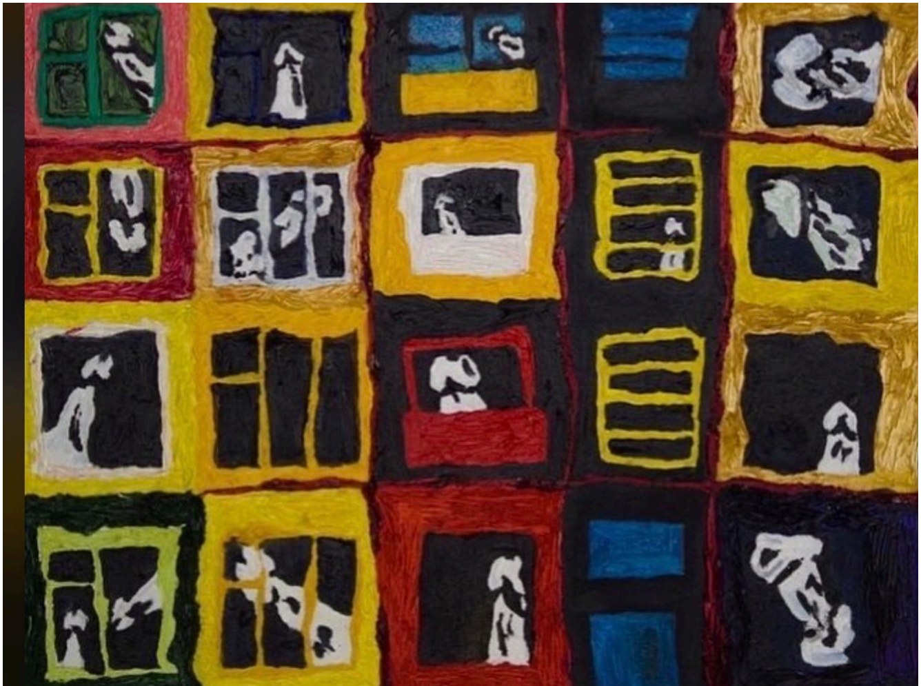
mage: ARTWORK 30 x 30 cm oil at canvas by Marina Solnzeva (Berlin artist) imagofeminae # XXXII spring 2022

women image lifestyle an international quarterly women's magazine SPRING 2022 # XXXII ISSN 2195-2000 Deutsche Nationalbibliothek ONLINE - VIDEO - DIGITAL PRINT - PODCAST